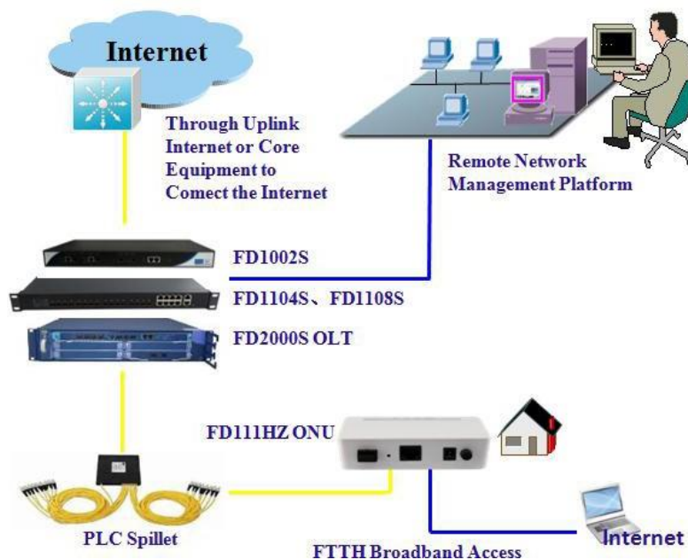
Figure: FD600-111G-HZ600 Application Diagram